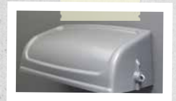
3-Roll paper guard